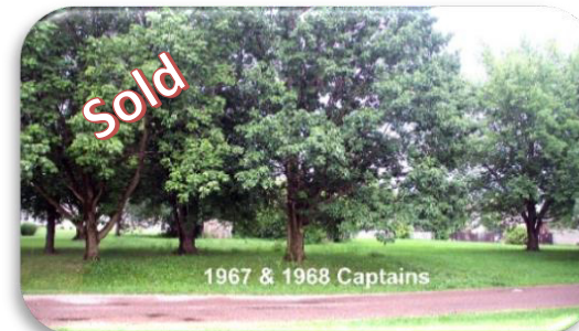
1967 & 1968 Captains, Worden