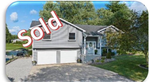
102 Shore Dr SW, Edwardsville 3 Bed 3 Bath, Covered boat dock