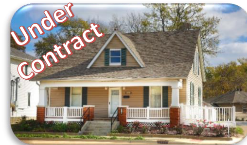
904 Vandalia Collinsville