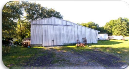
Moro Rd Moro 15 Acres Pole Barn, Horse Stalls $360,000